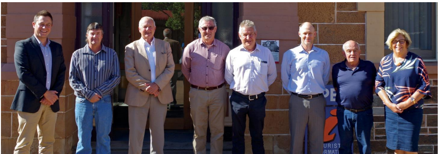
The Commission meeting with representatives of the District Council of Orroroo Carrieton as part of its visiting program in April 2019.