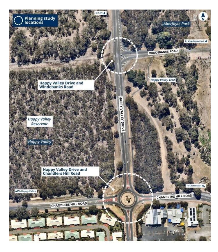
Map of the planning study area