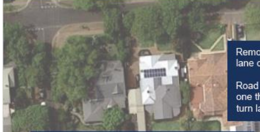
Removal of existing painted median and parking lane on Nottage Terrace east of 32 Nottage Terrace.

Road realignment on Nottage Terrace to provide one through lane, one shared through lane/left turn lane and one left turn lane.