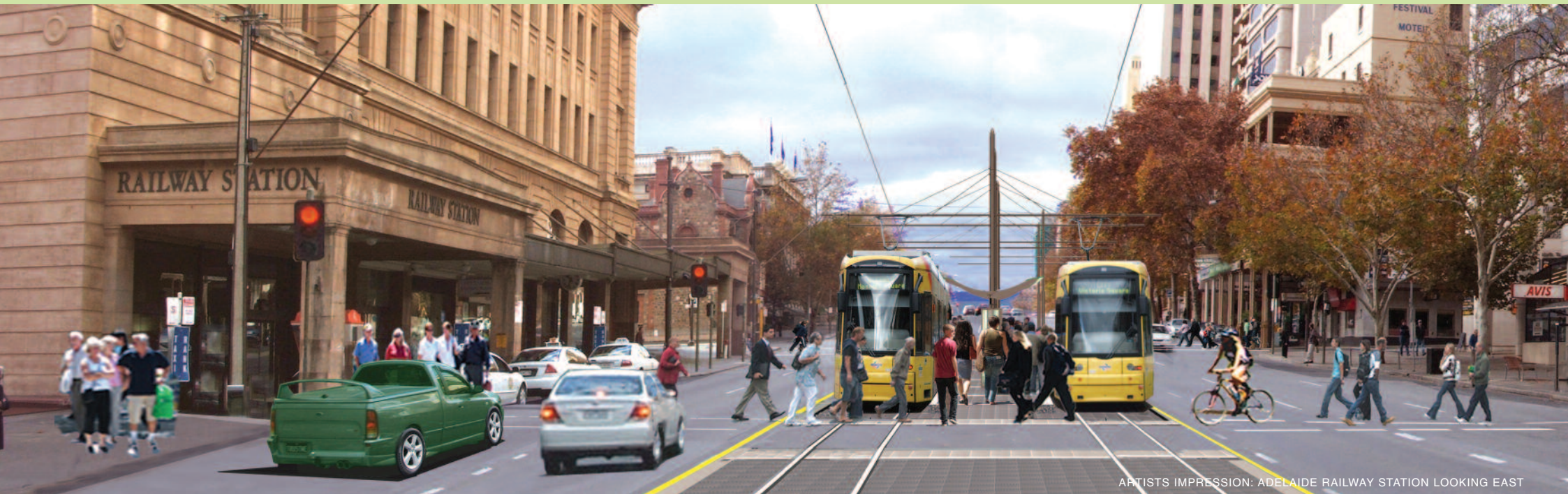
ARTISTS IMPRESSION: ADELAIDE RAILWAY STATION LOOKING EAST

If you would like to be kept informed of progress with the project, please check for updates on the website. A summary of the Response Forms will be placed on the website.