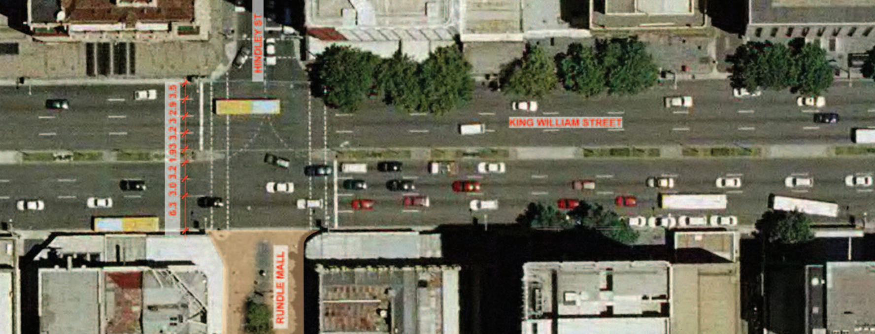
SECTION OF KING WILLIAM STREET WITHOUT TRAMS