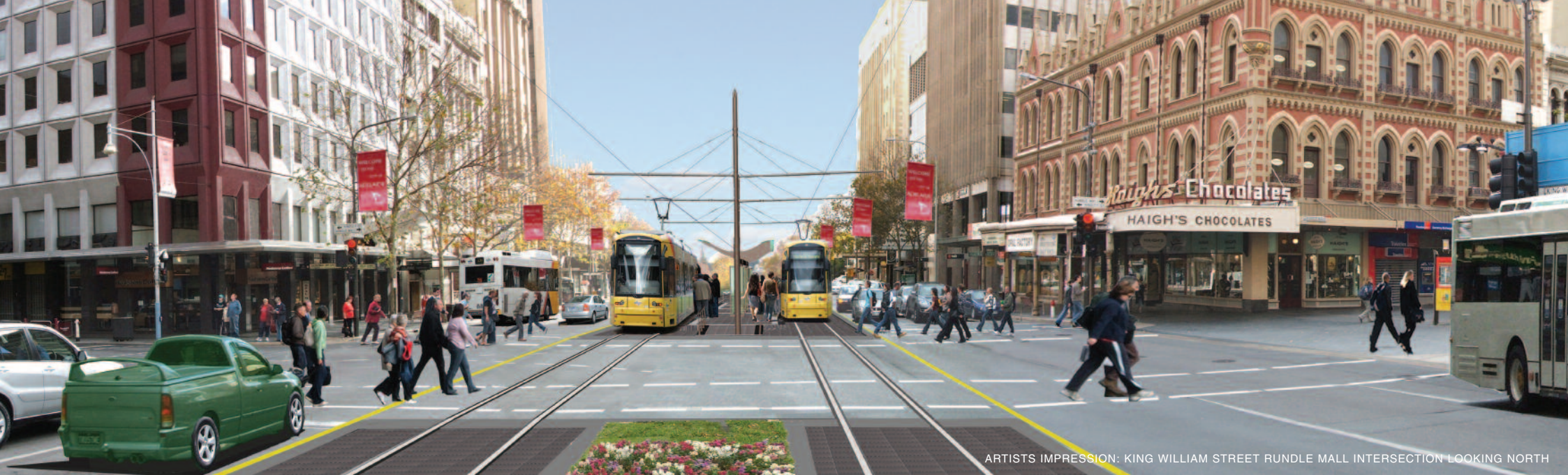
ARTISTS IMPRESSION: KING WILLIAM STREET RUNDLE MALL INTERSECTION LOOKING NORTH