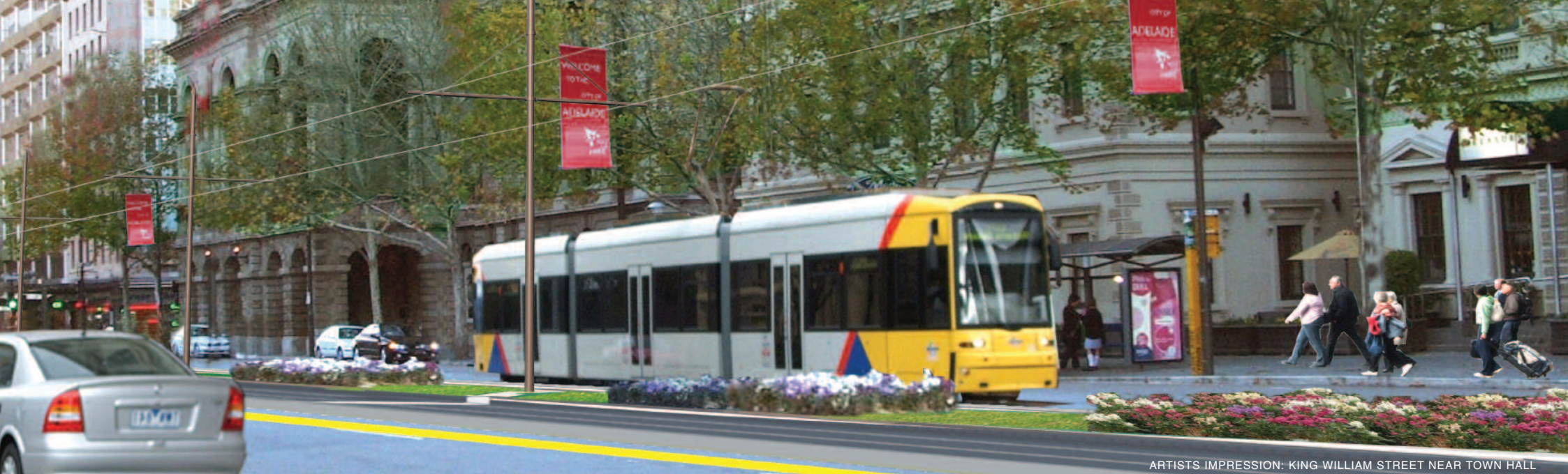
ARTISTS IMPRESSION: KING WILLIAM STREET NEAR TOWN HALL