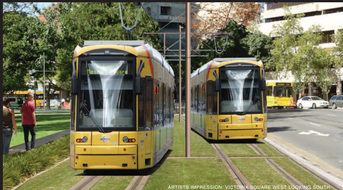
ARTISTS IMPRESSION: VICTORIA SQUARE WEST LOOKING SOUTH