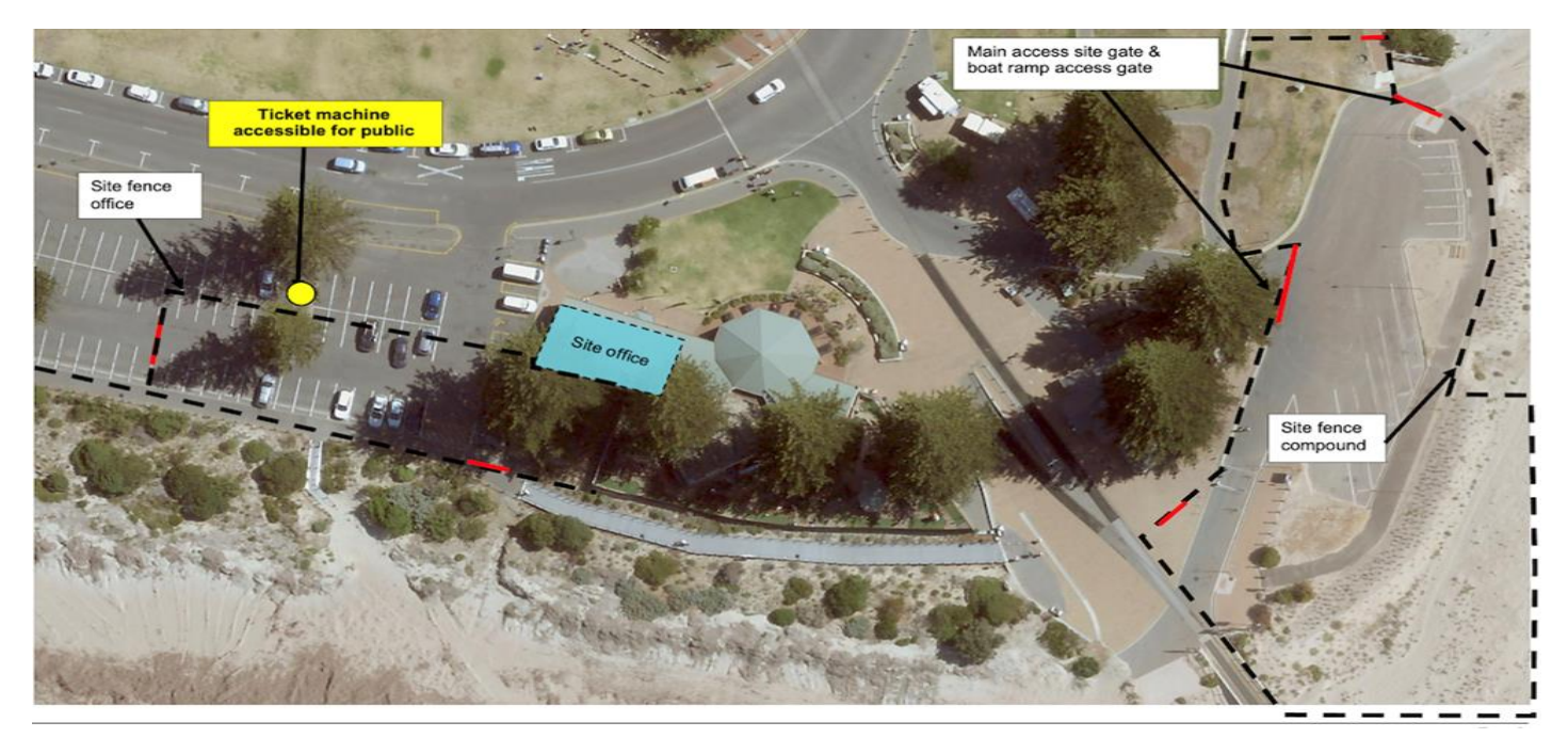
Site establishment area

It is intended that construction activities, including a site establishment area for site offices, materials and equipment storage, will be limited to a defined location as shown in the plan below. This area will also restrict access to the foreshore carpark behind the horse stables during construction.