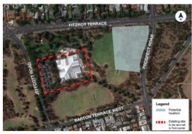
Proposed north-east corner location