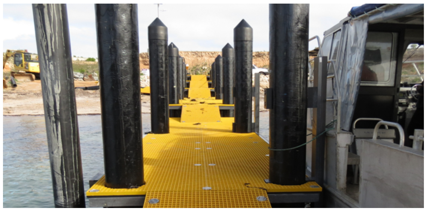
Image: A new type of composite fibre reinforced plastic grated decking was used for the jetty. The decking has an anti-slip coated surface, is yellow in colour to ensure its visibility and is designed to be low maintenance, durable and last a long life span.