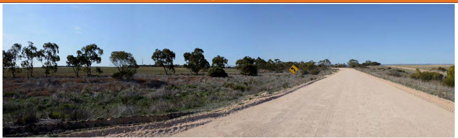
View north towards project corridor