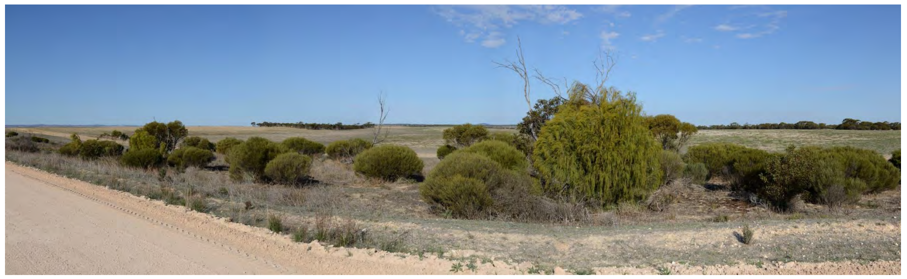
View east towards project corridor