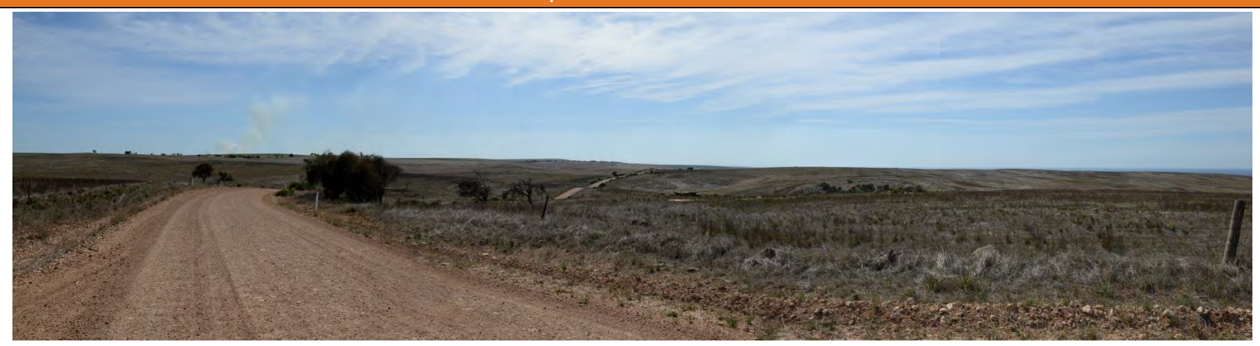
View north to east