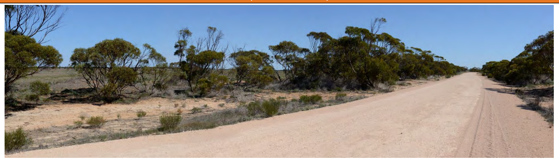
View southwest along corridor