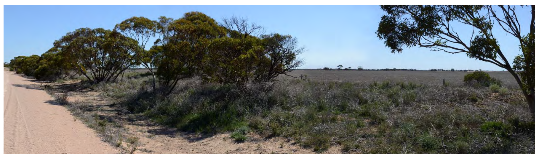
View northwest along corridor