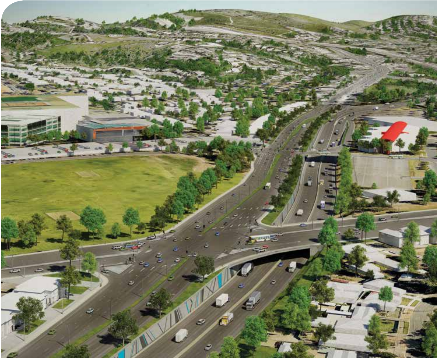
Concept of South Road/Sturt Road intersection