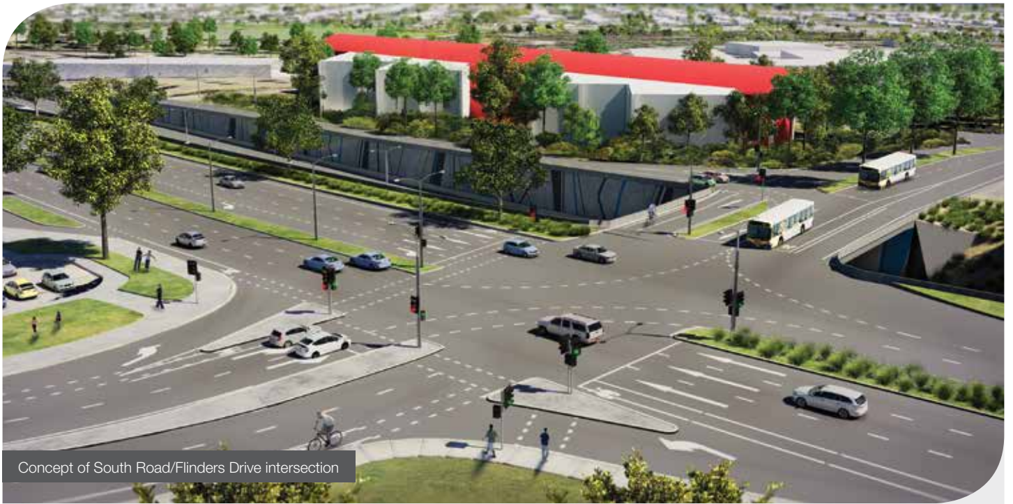
Concept of South Road/Flinders Drive intersection