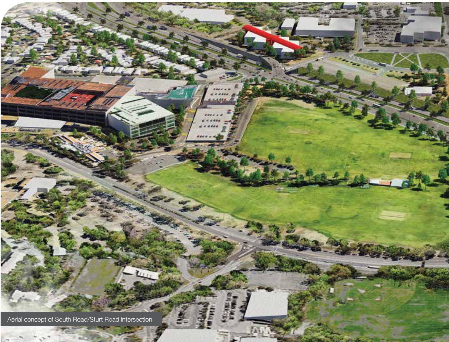
Aerial concept of South Road/Sturt Road intersection