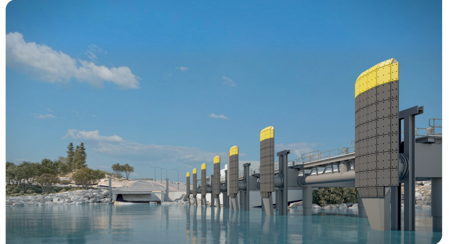
Image: Artist impression of the Penneshaw ferry infrastructure at project completion