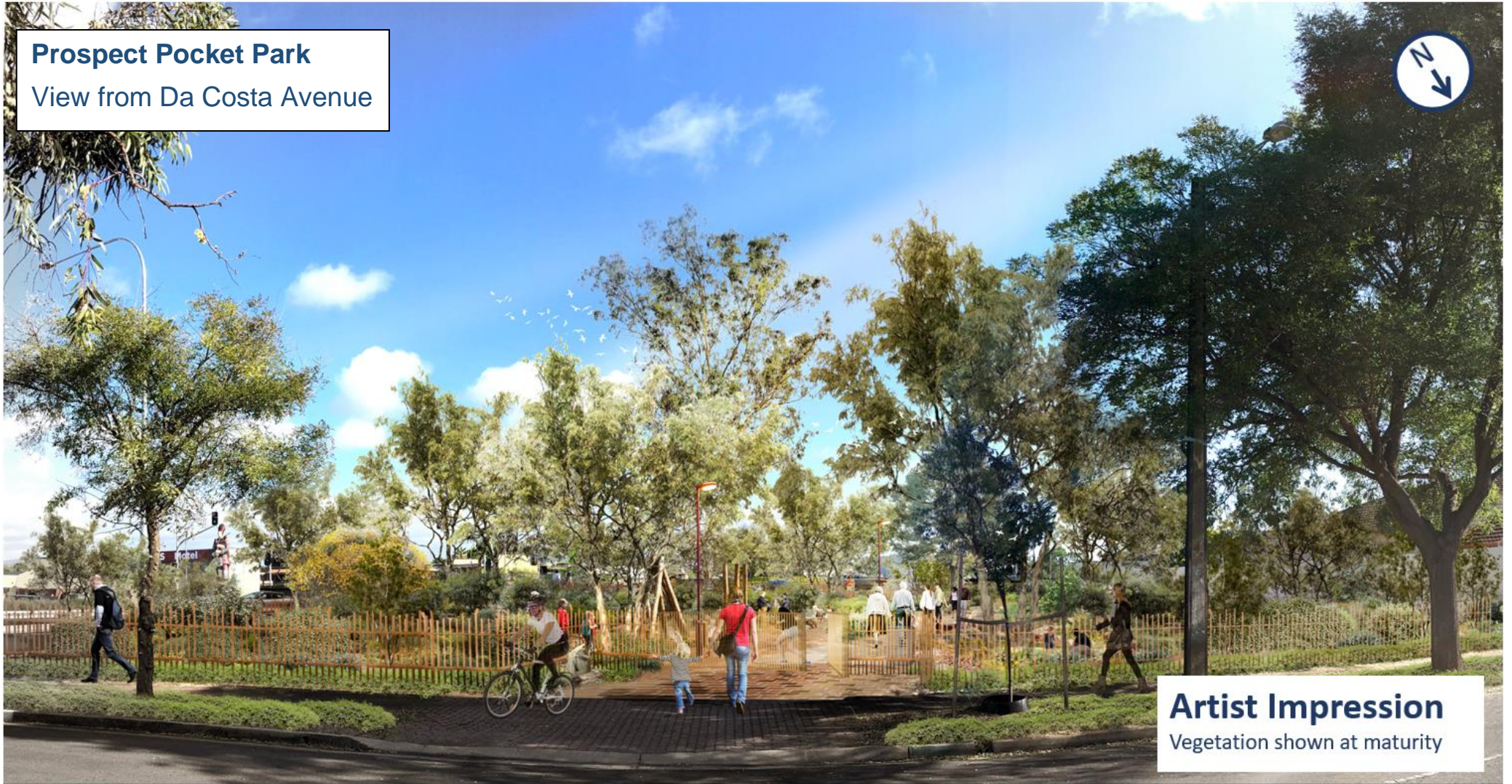
Artist Impression Vegetation shown at maturity