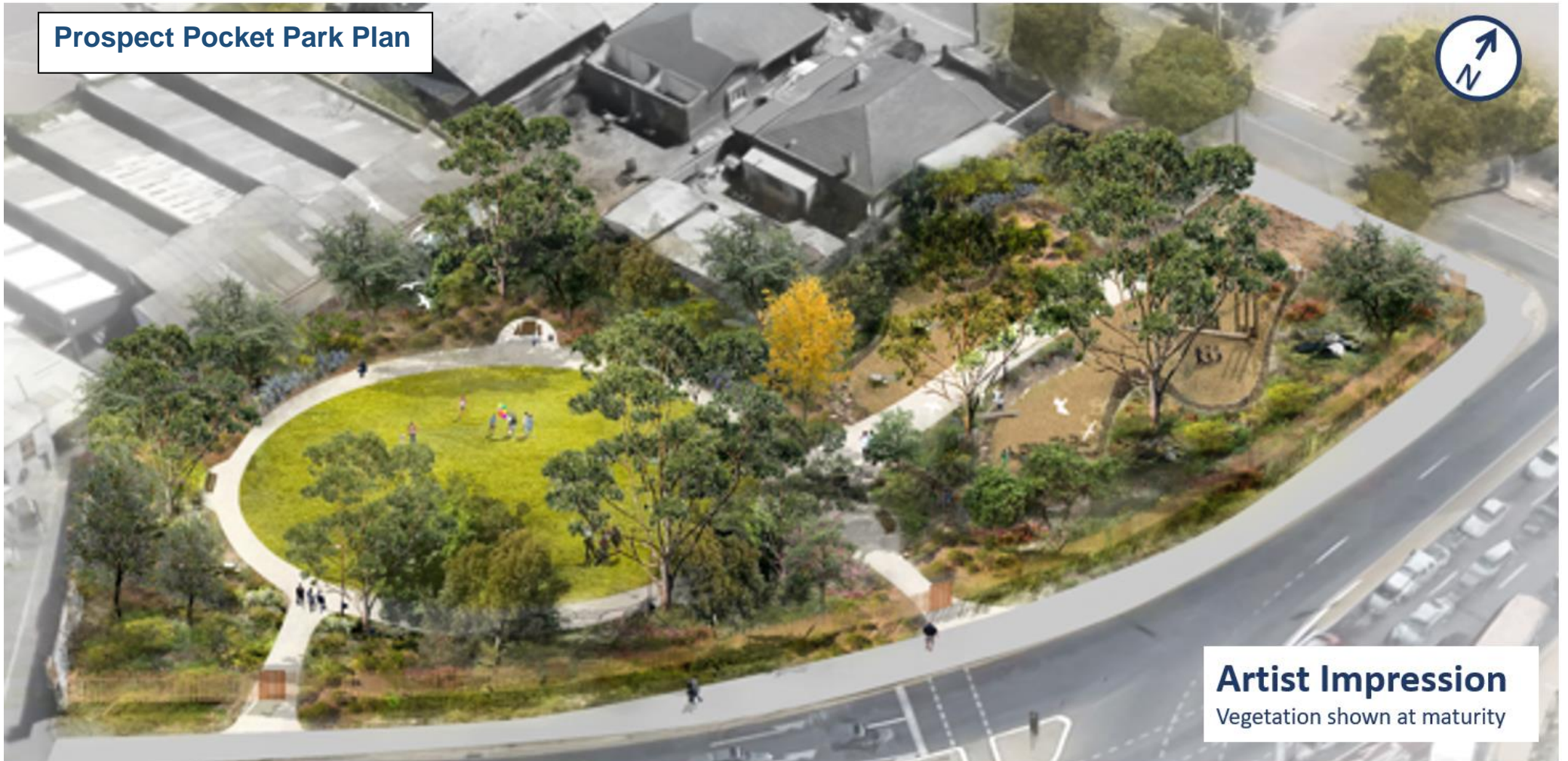
Artist Impression Vegetation shown at maturity