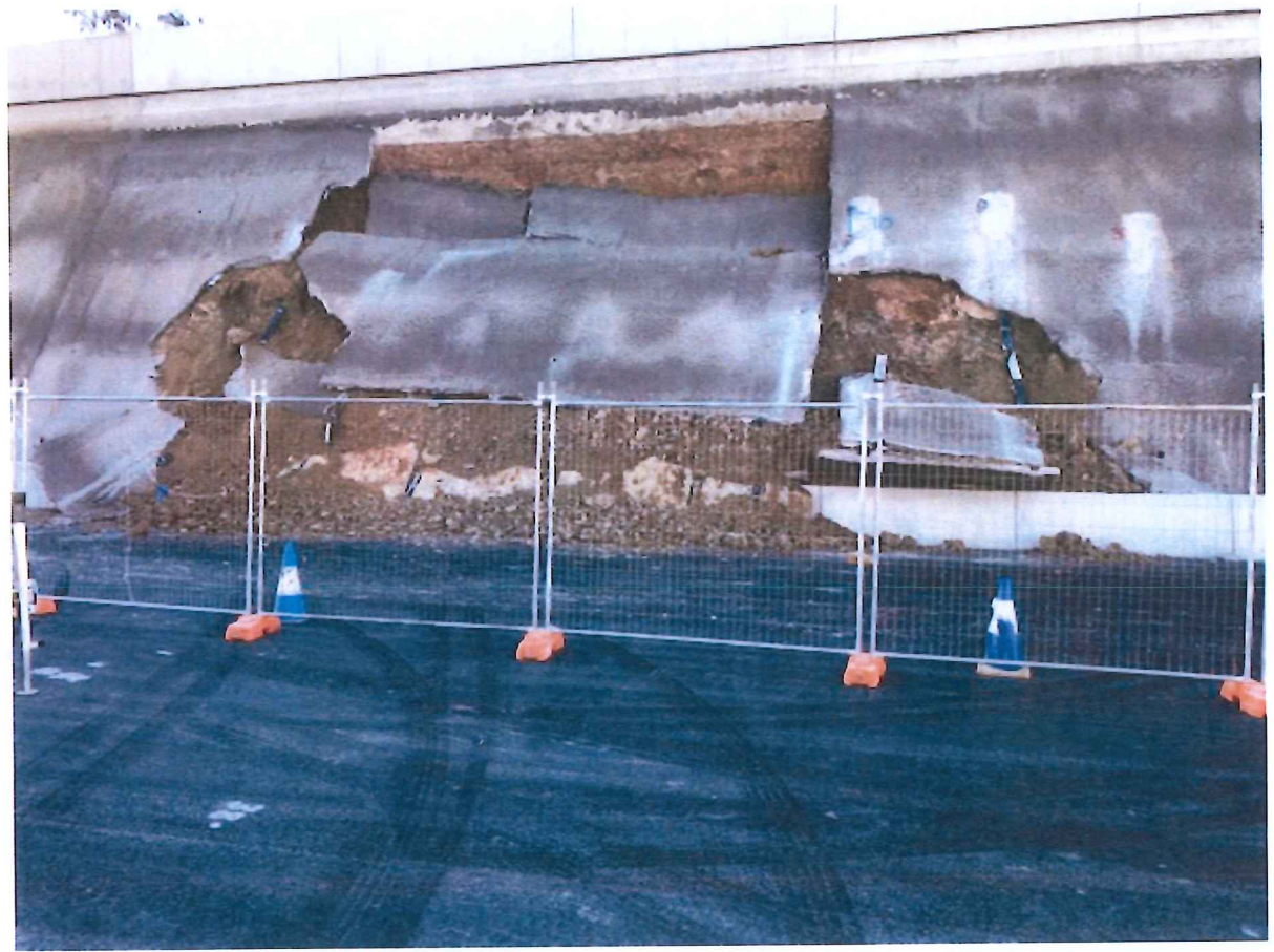
Info below - is going to Jon W for approval.