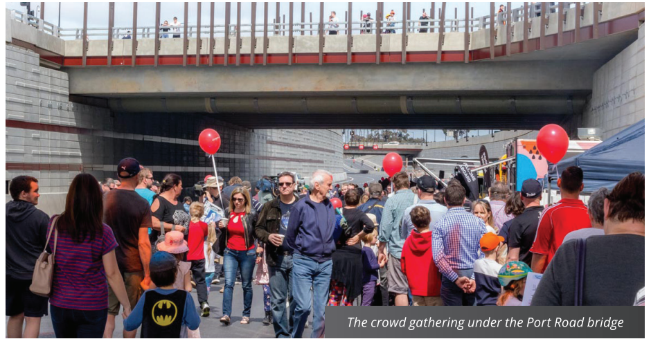
The crowd gathering under the Port Road bridge

The day was a great success and provided the opportunity for the T2T Project team to thank people living and working in the local area and motorists for their patience during construction.