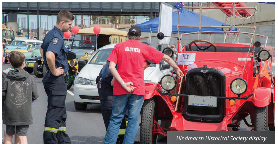
Hindmarsh Historical Society display