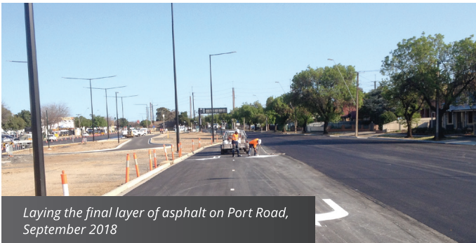
Laying the final layer of asphalt on Port Road, September 2018