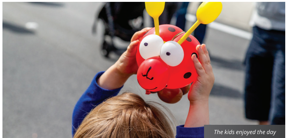
The kids enjoyed the day