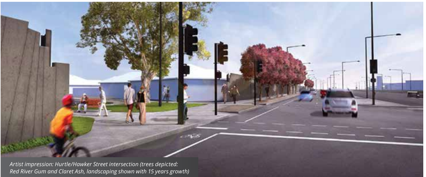
Artist impression: Hurtle/Hawker Street intersection (trees depicted: Red River Gum and Claret Ash, landscaping shown with 15 years growth)