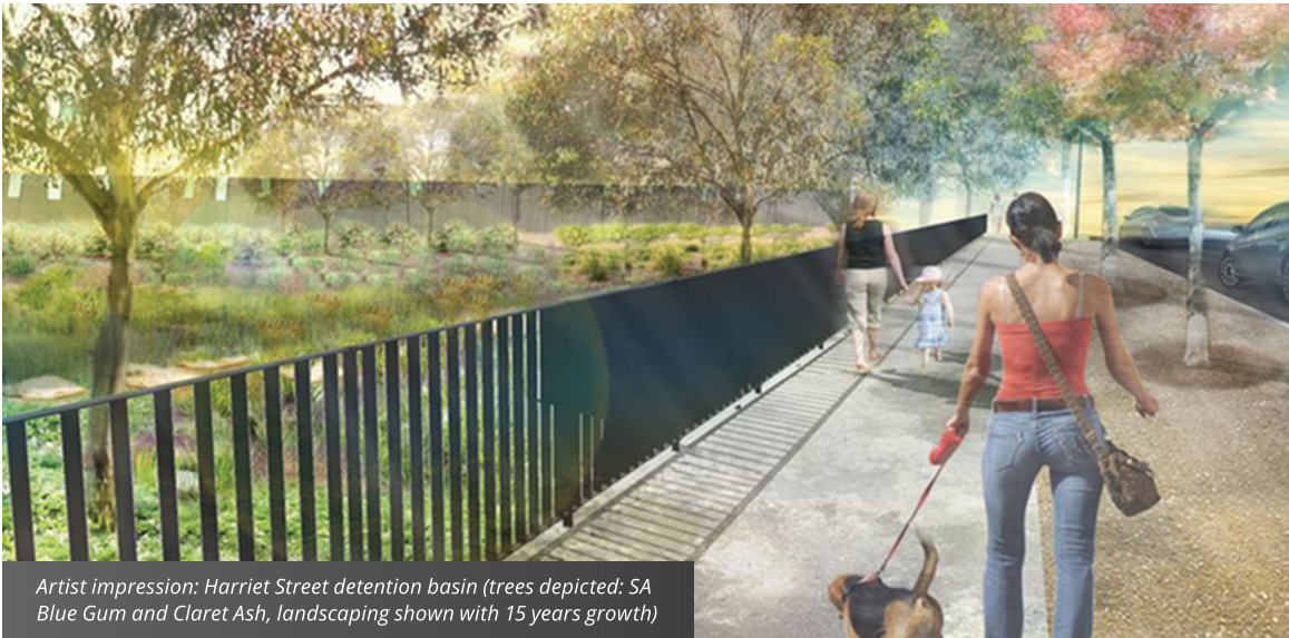
Artist impression: Harriet Street detention basin (trees depicted: SA Blue Gum and Claret Ash, landscaping shown with 15 years growth)