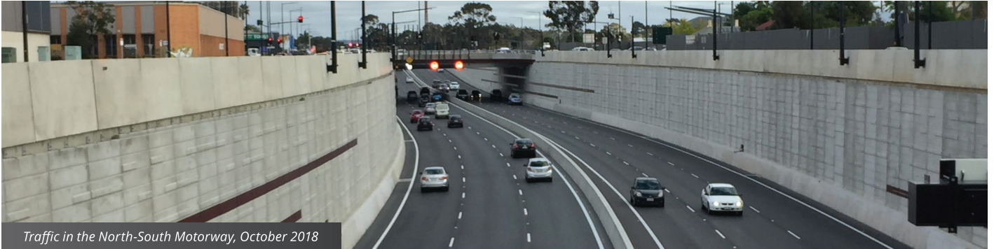
Traffic in the North-South Motorway, October 2018