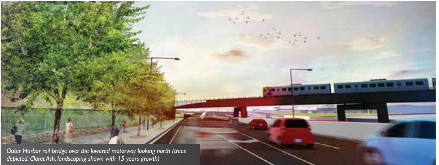
Outer Harbor rail bridge over the lowered motorway looking north (trees depicted: Claret Ash, landscaping shown with 15 years growth)