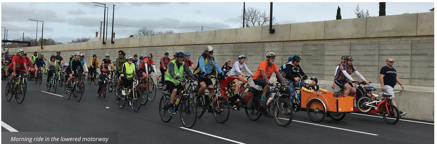
Morning ride in the lowered motorway