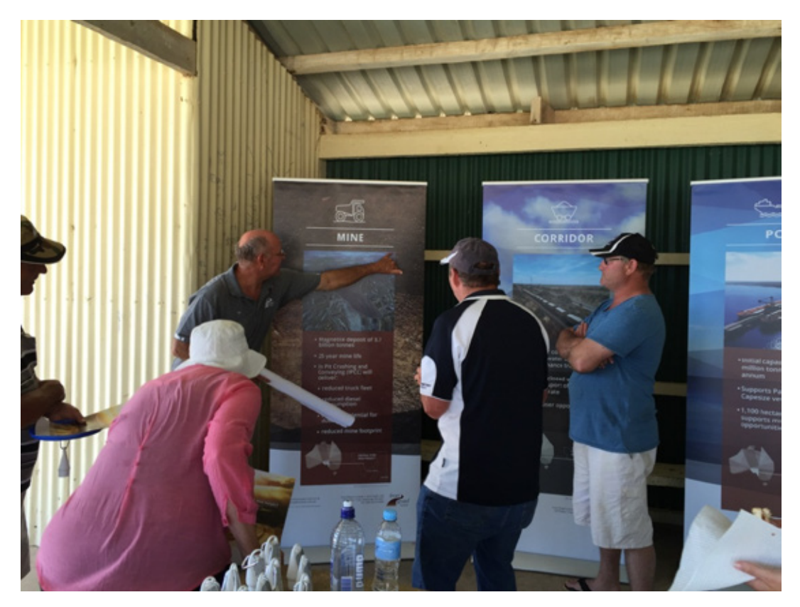
Plate 6-3 Iron Road Discussing the CEIP with Local Community Members

A summary of the key concerns and benefits raised is outlined in Appendix CC. Note that the benefits and issues relate to the CEIP as a whole, not just the CEIP Infrastructure. Various impact assessments have been undertaken and deal with the issues and/or concerns raised. Individual chapters deal with these extensively, as do technical reports, all of which form part of this EIS.