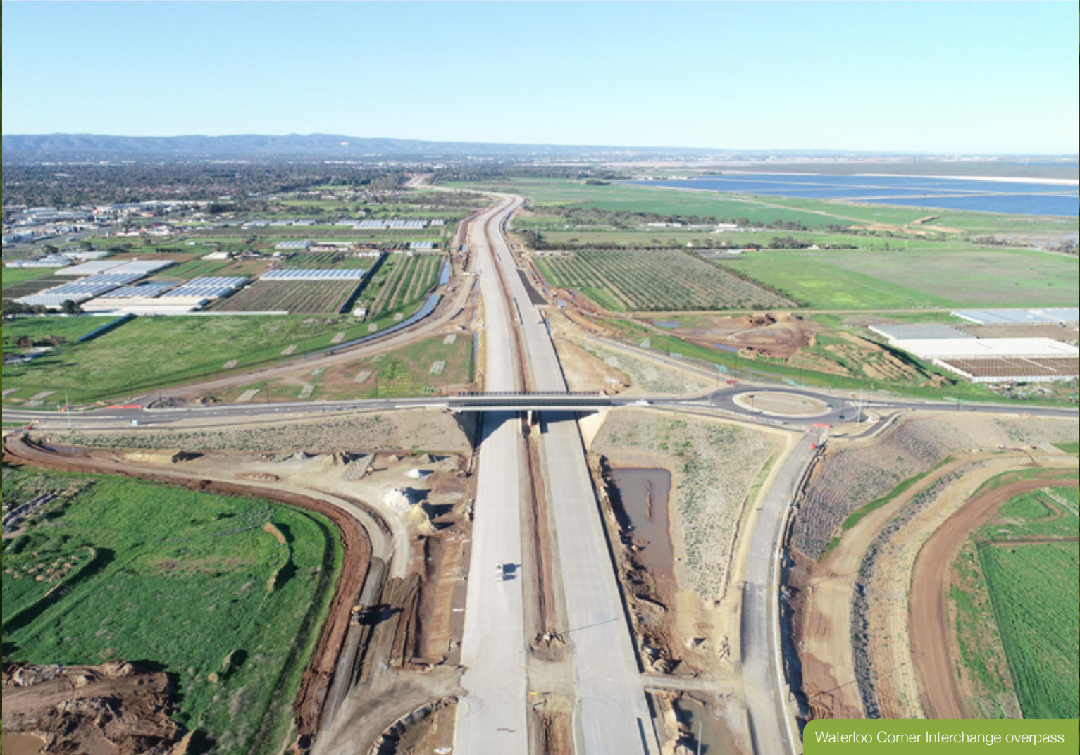
Waterloo Corner Interchange overpass