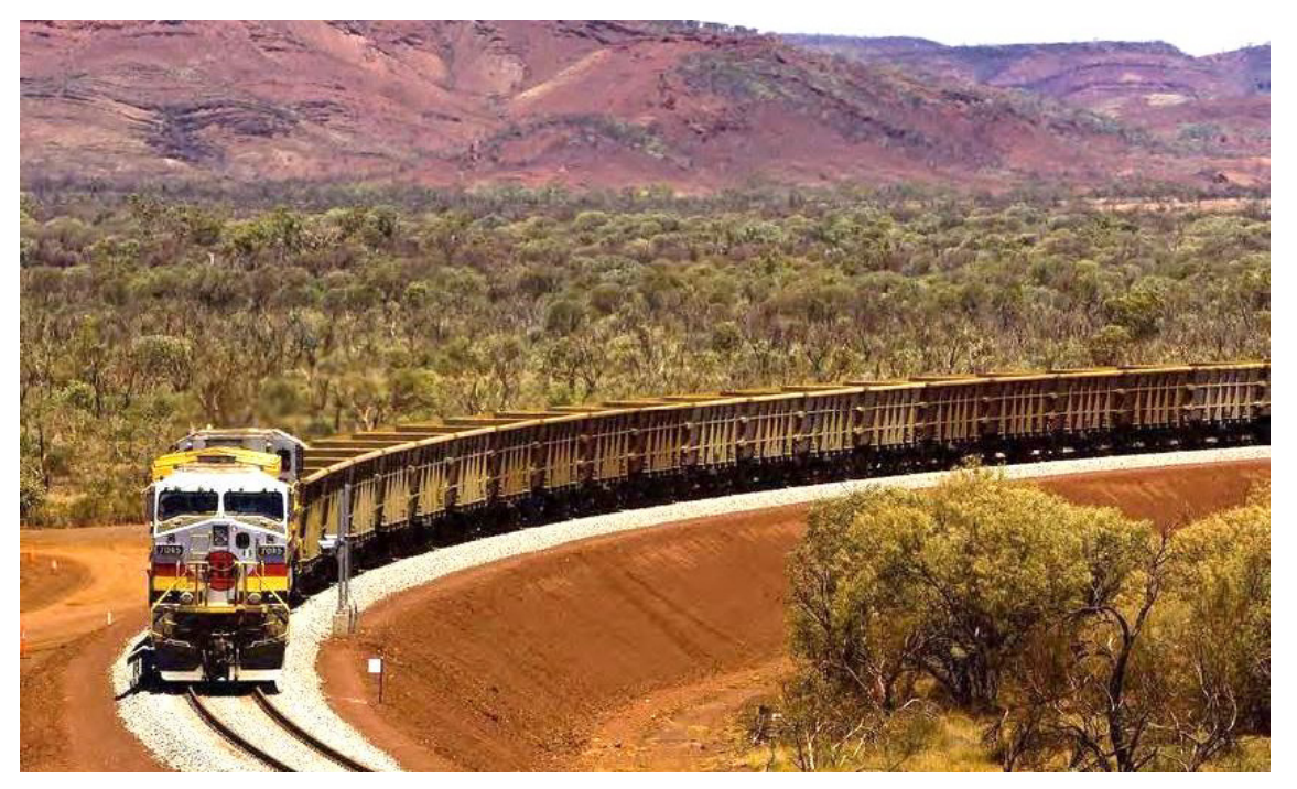
Plate 21-3 The Proposed CEIP Infrastructure will Bring Strong Benefit to the Local Community

The assessment of potential impacts to workforce availability for existing industries shows that the CEIP would have a medium impact , given that any impact would be long term (>3 years) but is likely to only affect individuals and businesses located within the local study area.