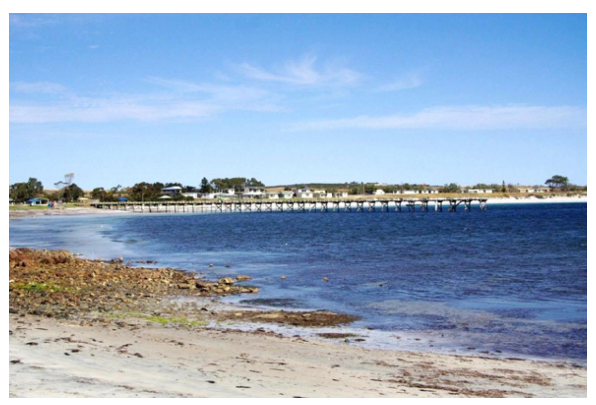
Plate 21-1 The CEIP will Create Economic Benefits for Local Communities such as Port Neill