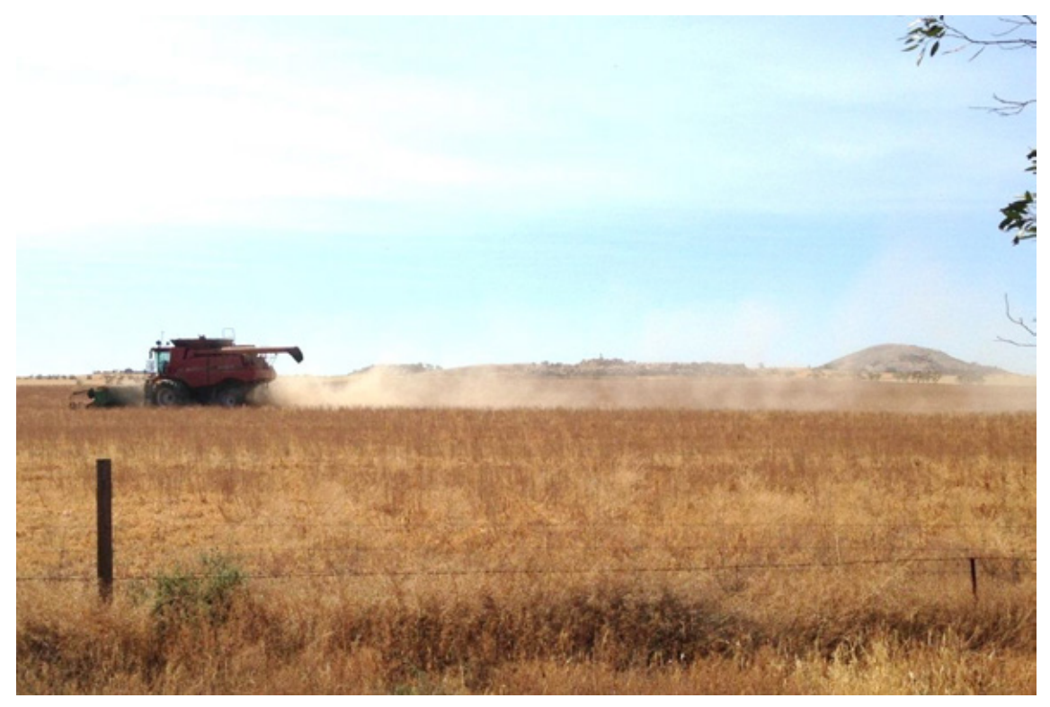
Plate 21-2 Agriculture Currently Underpins the Local Economy on the Eyre Peninsula

South Australia had a Gross State Product (GSP) of $94.2 billion in 2012/2013 (ABS 2013). Major contributing industries included manufacturing (8.81%), ownership of dwellings (8.48%), health care and social assistance (8.37%) and construction (7.89%). Agriculture and mining were also important contributors at 5.16% and 4.42% respectively.