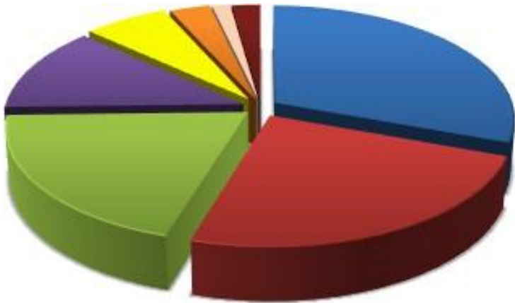
State Entitlements Total Commonwealth Financial Assistance Grant Funding for Local Government – 2024-25 Allocation by State as a Percentage of Total Funding Distributed

In 2024-25, there were 68 councils, the Outback Communities Authority and five Aboriginal communities eligible for FA Grants in South Australia.