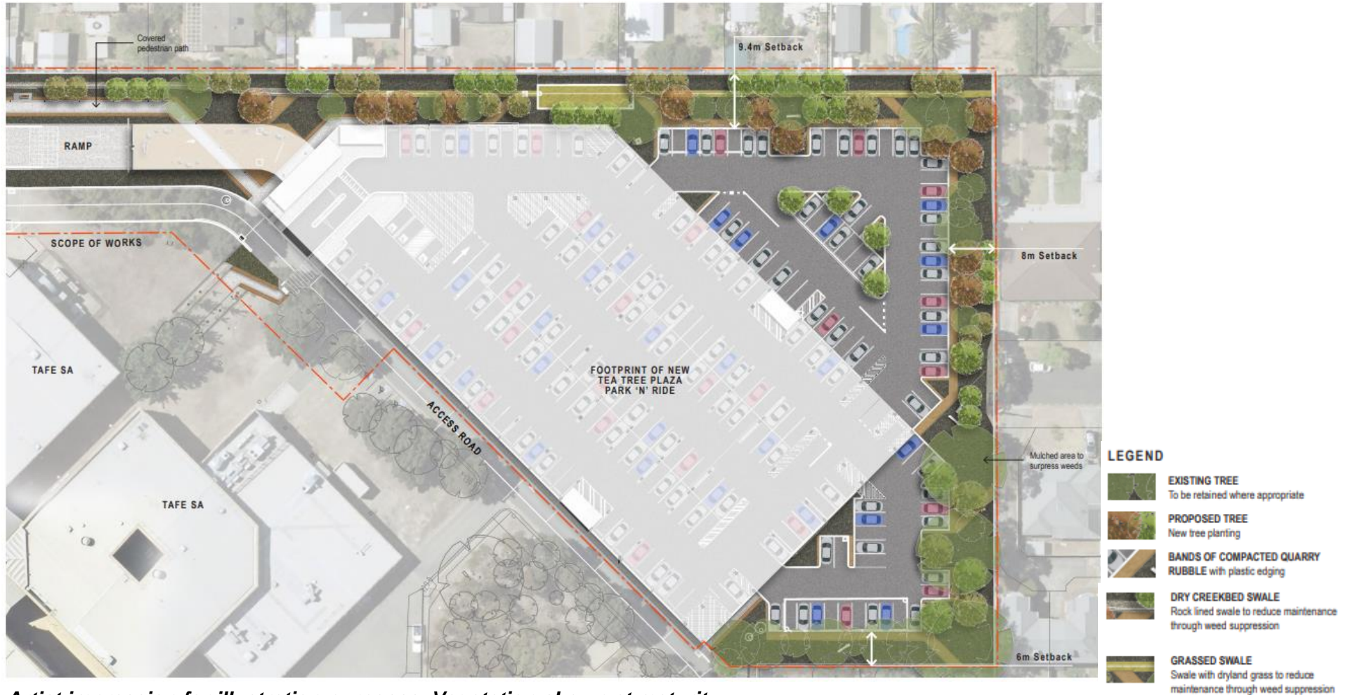
Artist impression for illustration purposes. Vegetation shown at maturity.