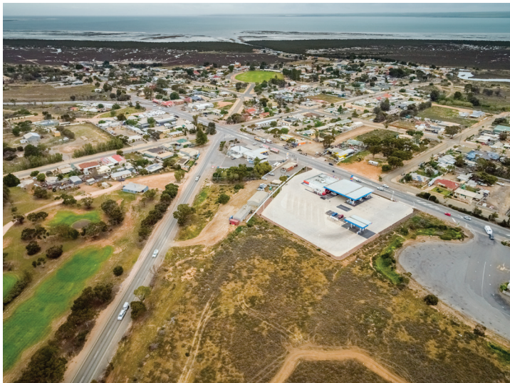
Aerial image of Port Wakefield September 2020

If you are a local business and would like to be part of the directory, please visit the website or email: enquiries@pw2pa.com.au or phone: 1300 161 407.