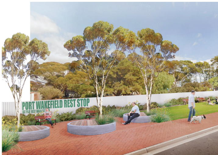
Artist impression – proposed Town Park

Most attendees agreed that the session improved their knowledge of the project and they would be interested in attending similar events. For more information about community feedback at the session, please visit the PW2PA Alliance website.