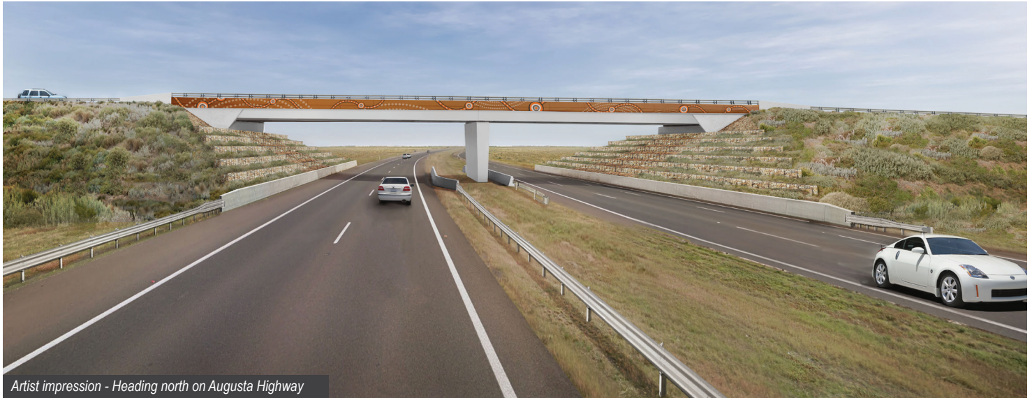
Artist impression - Heading north on Augusta Highway