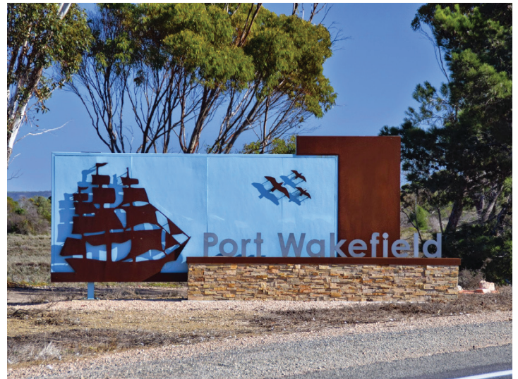
Southbound entry signage to Port Wakefield

The PW2PA Alliance encourages travellers to Break your drive and Support a Local by visiting businesses in Port Wakefield.