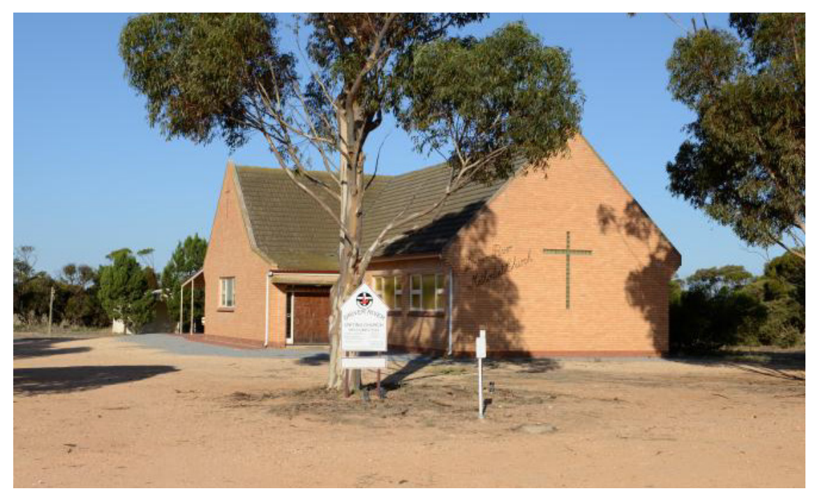
Plate 20-3 Verran Methodist Church

The proposed railway line passes through the Verran township. No registered heritage places are recorded within Verran; however, a church (Plate 20-3) is located approximately 140 m east of the railway line and a cemetery has been identified on Pipeline Road, approximately 1 km west of the railway line.