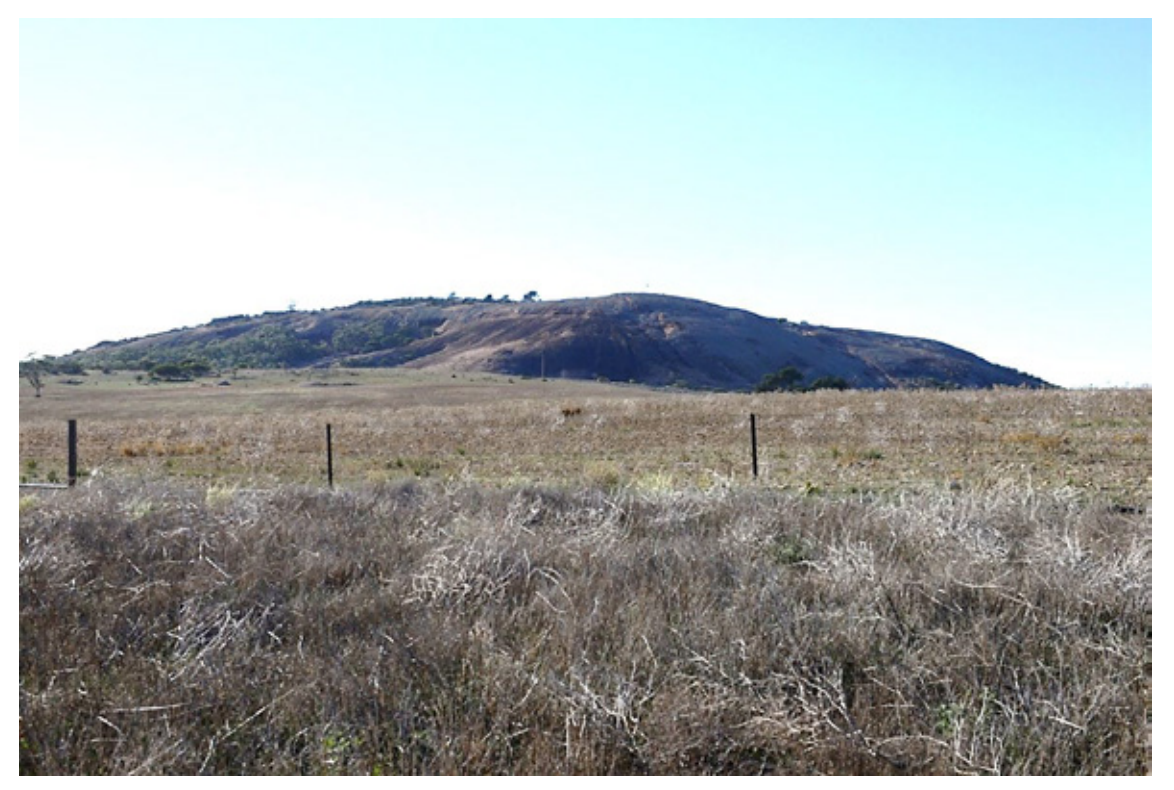
Plate 20-5 Mount Wudinna

Mount Wudinna and the surrounding environment (Plate 20-5 and Plate 20-6) is listed on the Register of the National Estate as a State Heritage Place and as a geological monument. Turtle Rock and the Polda Rocks are two notable features located in the environment surrounding Mount Wudinna. Within the Wudinna township, two churches and a cemetery have been identified, none of which are formally listed on a statutory heritage register.