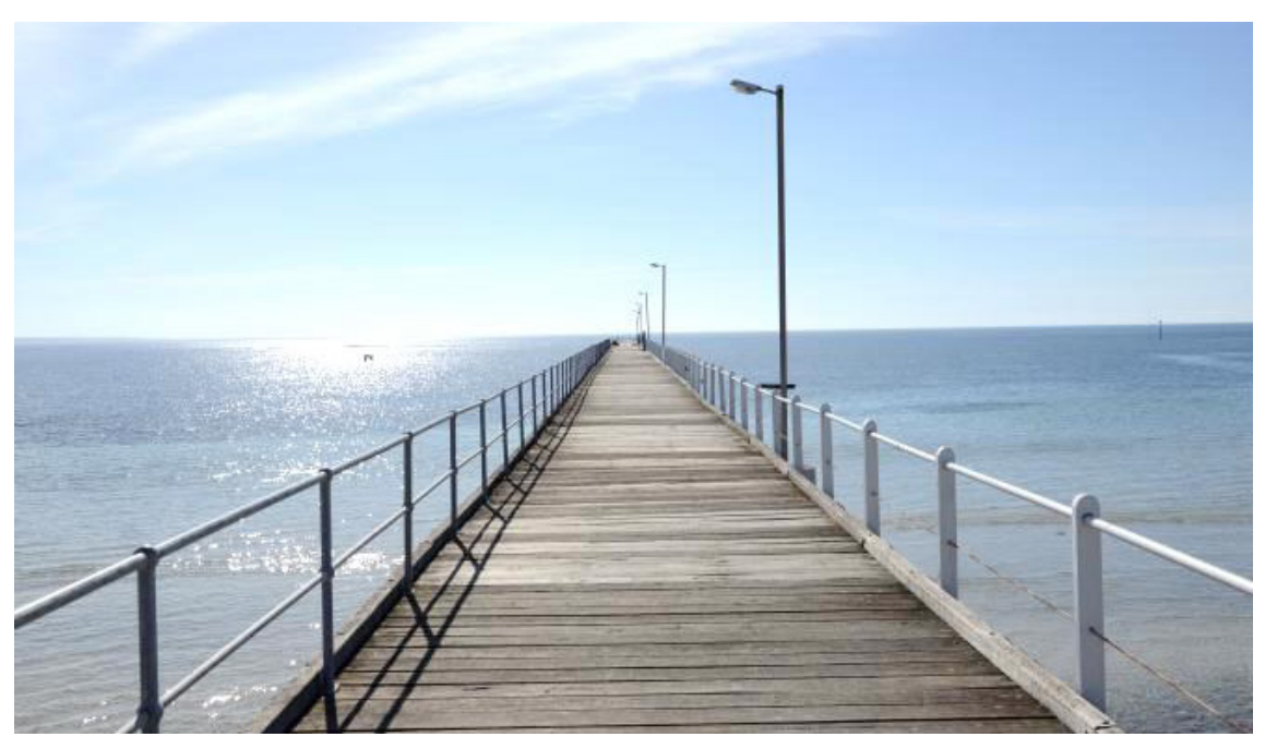
Plate 20-4 Port Neill Jetty

A number of places of heritage significance are located within Port Neill, including the jetty (Plate 20-4), the Port Neill Hotel, the Uniting Church and the Lady Kinnard Anchor. Each of these places of heritage significance is located more than 2.5 km from the proposed infrastructure corridor. The closest place of heritage significance associated with Port Neill is the cemetery, approximately 2 km east of the proposed infrastructure corridor.