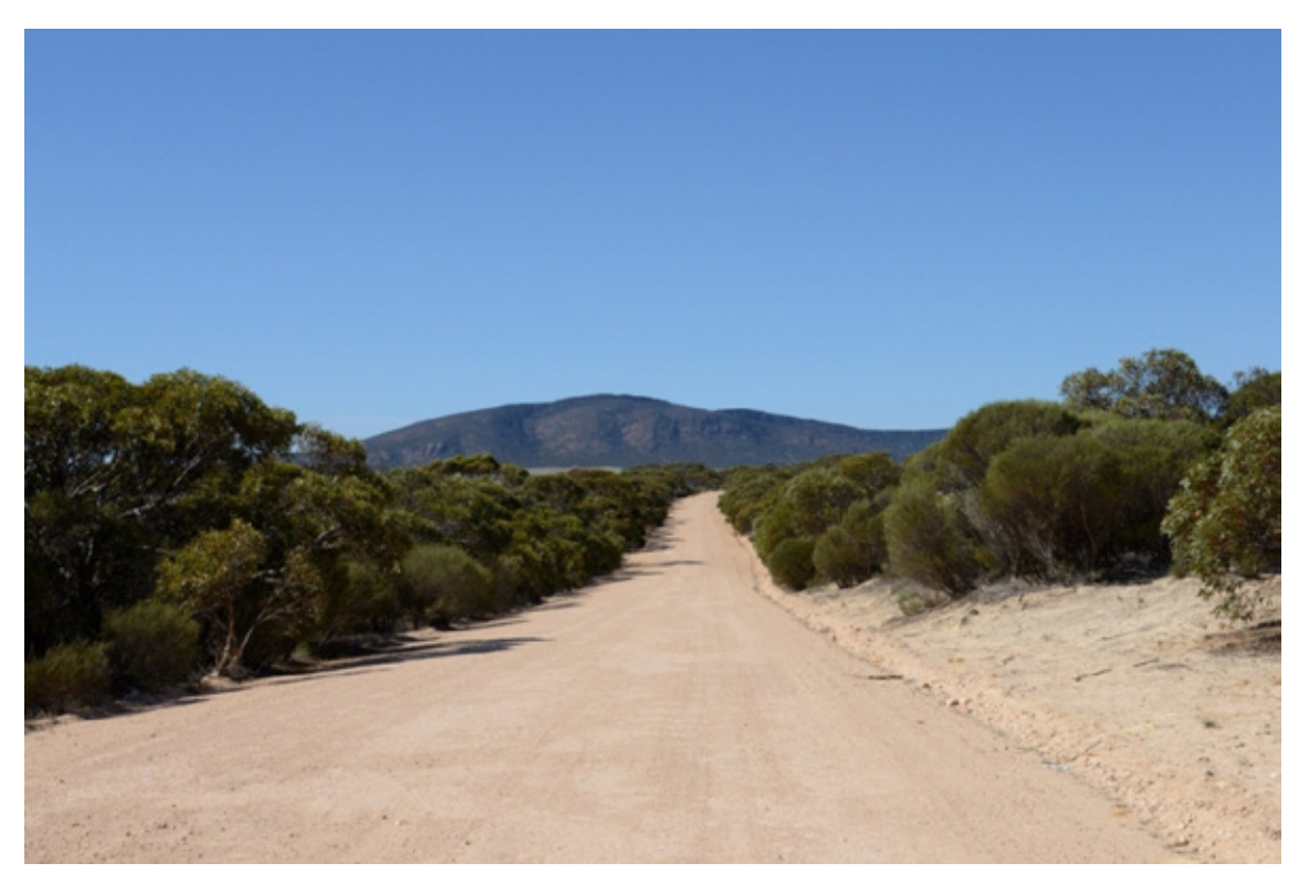
Plate 20-2 Darke Range Viewed from O'Connor Road

As the proposed infrastructure corridor continues south it does not traverse any places of non-Aboriginal heritage significance; however, Darke Range (Plate 20-2), Rudall Conservation Park and Arborville Scrub are all located within the 5 km of the proposed infrastructure corridor and are all listed on the Register of the National Estate.