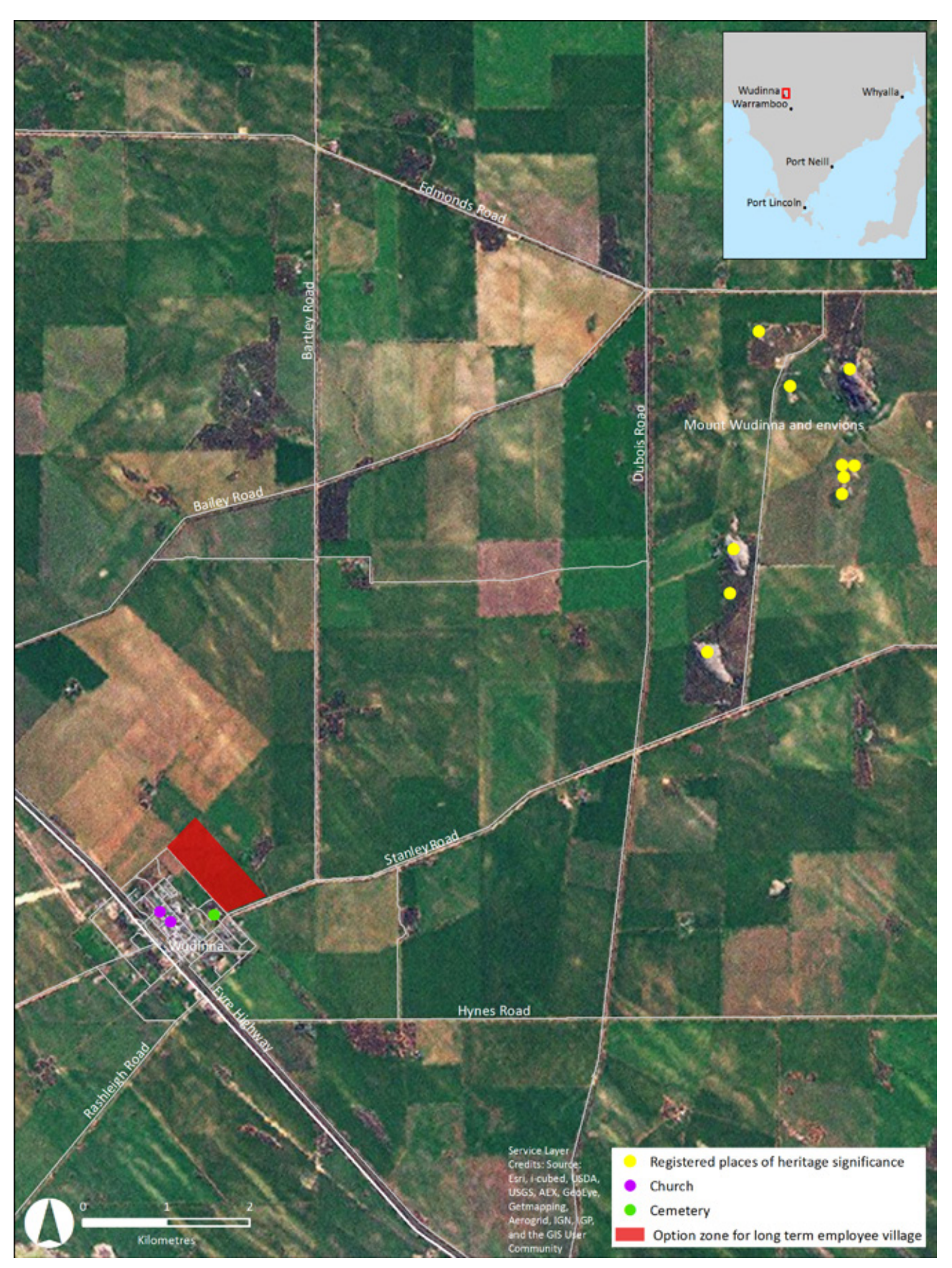
Figure 20-2 Non-Aboriginal Heritage (Long-Term Employee Village)