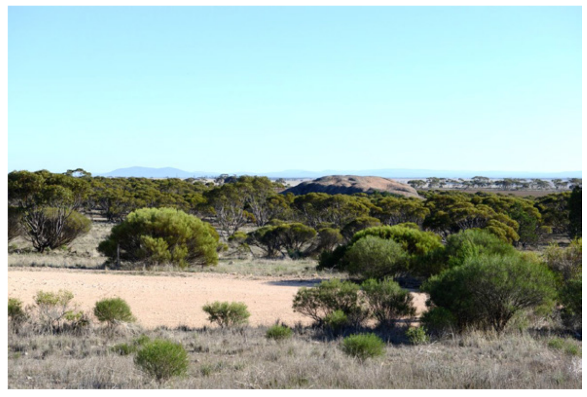
Plate 20-6 Turtle Rock

Identified places of non-Aboriginal heritage significance within 5 km of the general vicinity of the long-term employee village site are summarised in Table 20-2 and spatially represented in Figure 20-2.