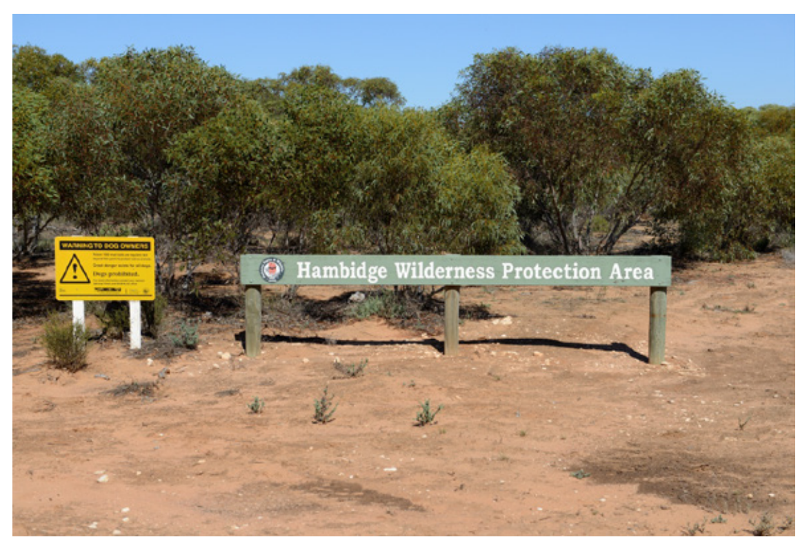
Plate 20-1 Hambidge WPA

As the proposed infrastructure corridor continues south it does not traverse any places of non-Aboriginal heritage significance; however, Darke Range (Plate 20-2), Rudall Conservation Park and Arborville Scrub are all located within the 5 km of the proposed infrastructure corridor and are all listed on the Register of the National Estate.