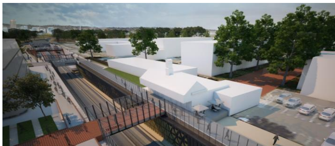
Artist impression: View of the old Bowden Railway Station building and the new Station Place pedestrian bridge

In recognition of the significance of the heritage listed Bowden Railway Station building the project team has been working on design and engineering solutions to preserve the building during construction, and to integrate it in the final urban design.