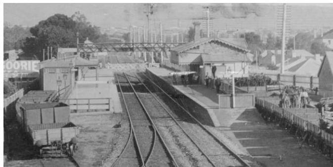
Bowden Railway Station c 1908

The Bowden Railway Station is one of the three original stations established when the first steam railways opened in April 1856. The station building is one of the two surviving original station buildings - the other being at Alberton.