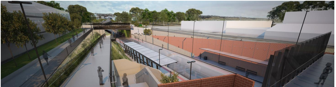
Artist Impression: New lowered Bowden Railway Station, view from Park Terrace

The ConneXion Alliance, comprising of Laing O'Rourke, AECOM and KBR, was announced in December 2016 to deliver the Torrens Rail Junction Project. The $238 million ($189.4m Australia Government funded and $48.6m South Australia Government funded) project will separate the interstate freight rail line from the Outer Harbor passenger rail line in the Park Lands and take the rail line under Park Terrace at Bowden. A new, lowered railway station will be built at Bowden, improving pedestrian connections to the Bowden Village, Entertainment Centre and Park Lands. The project will increase the efficiency of the national rail freight network, reduce traffic delays on Park Terrace, Port Road and on the adjacent road network and deliver improved pedestrian and cycling connectivity in Bowden and the Park Lands.