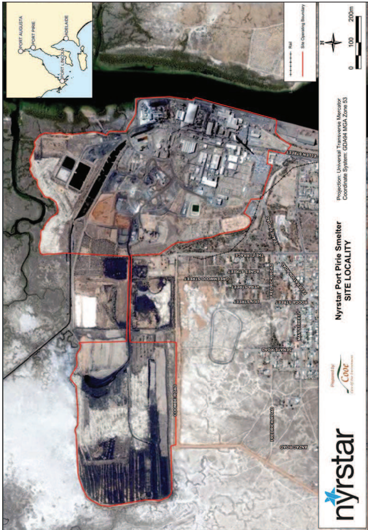
Figure 1 - Location and Site Plan