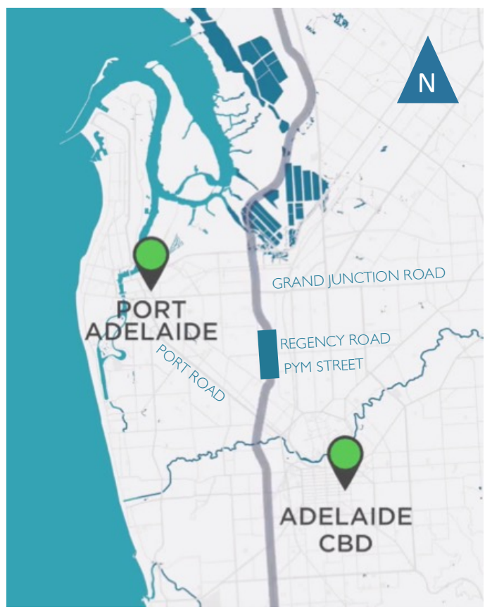
Regency Road to Pym Street Project location

McConnell Dowell, Mott MacDonald and Arup have recently worked together on the delivery of the Oaklands Crossing Grade Separation Project and other large-scale infrastructure projects in South Australia.