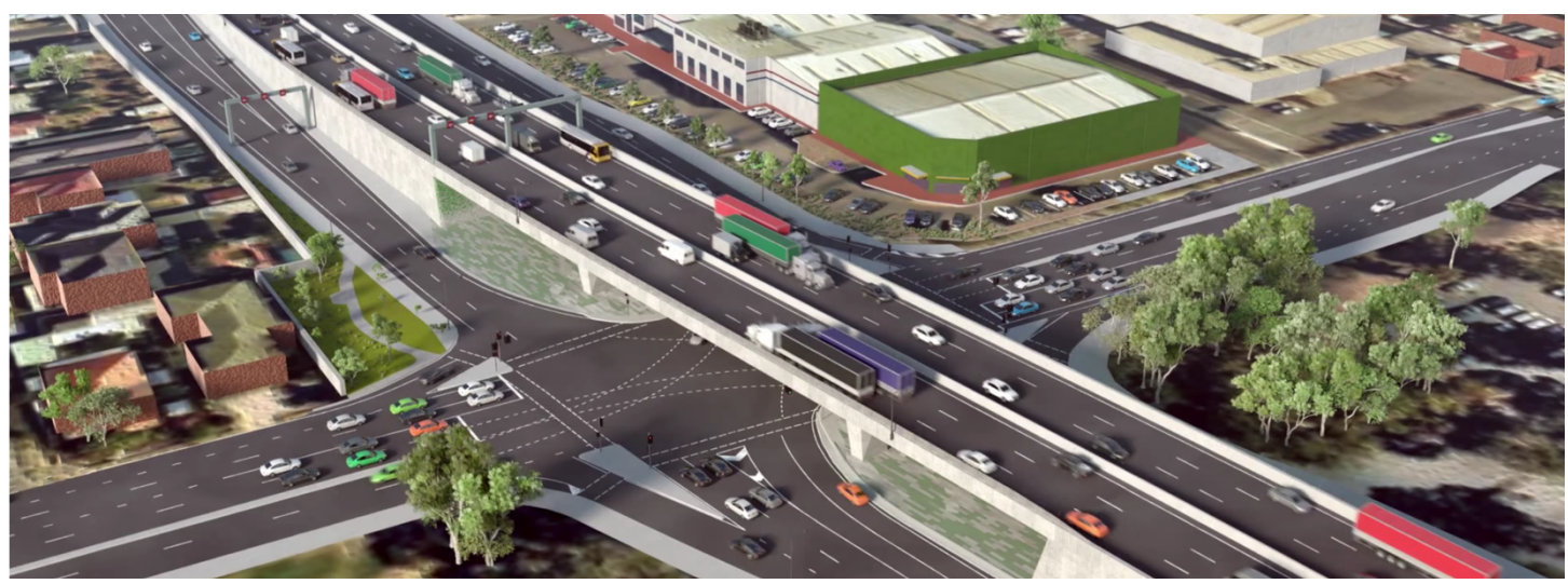
Artist's impression of the Regency Road overpass

If you have a local business that would like to work with the R2P Alliance, please contact us via email or phone using the details below.