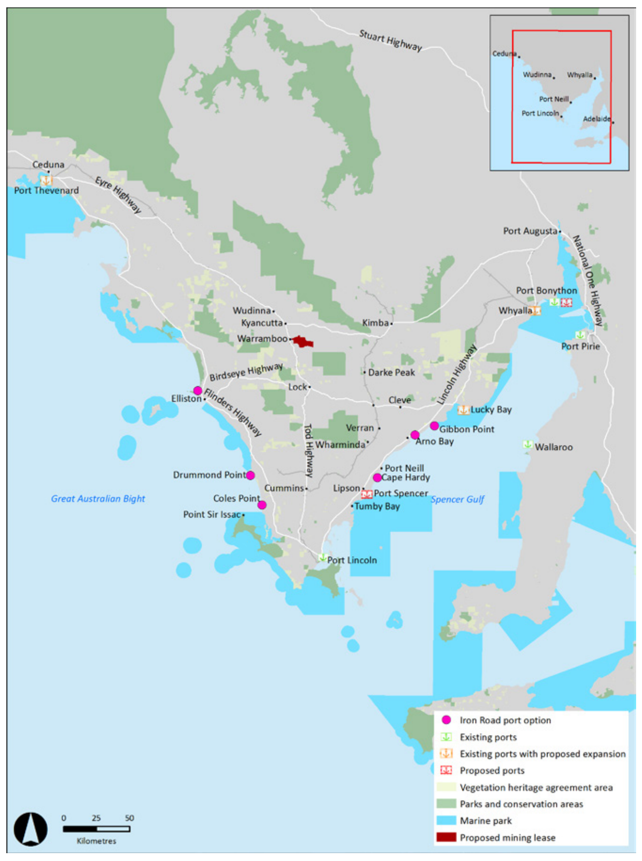
Figure 3-1 Alternative Port Locations