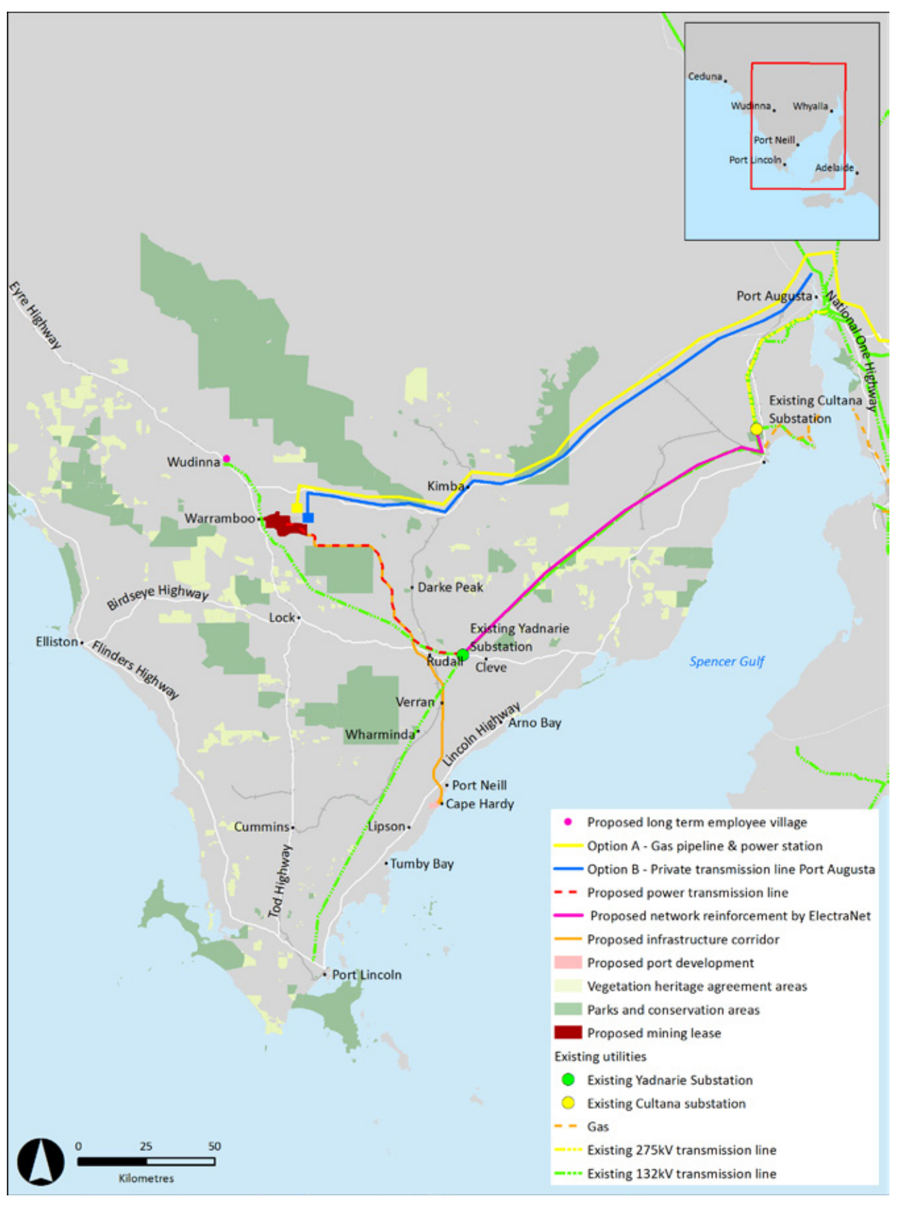
Figure 3-4 Existing Eyre Peninsula High Voltage Transmission Network