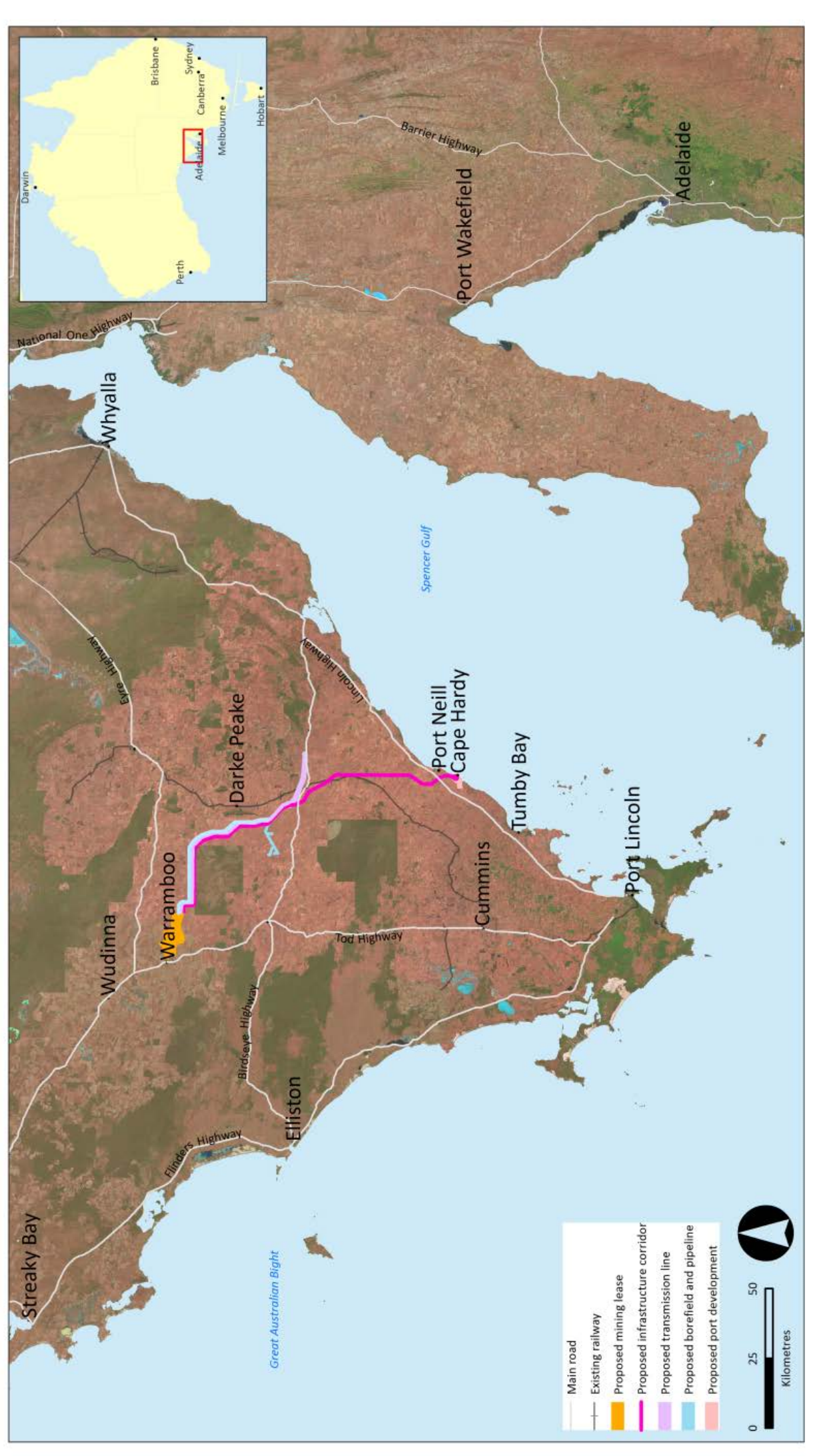
Figure 1-1 CEIP Location