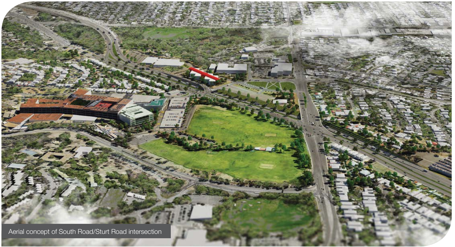
Aerial concept of South Road/Sturt Road intersection