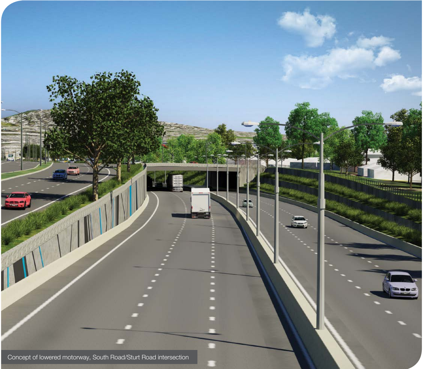
Concept of lowered motorway, South Road/Sturt Road intersection