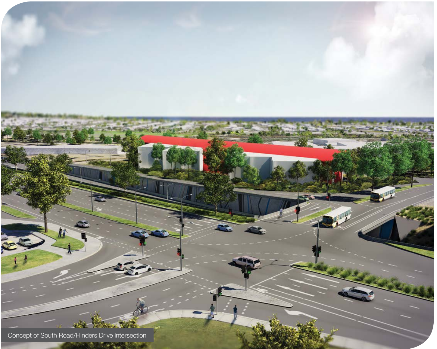
Concept of South Road/Flinders Drive intersection