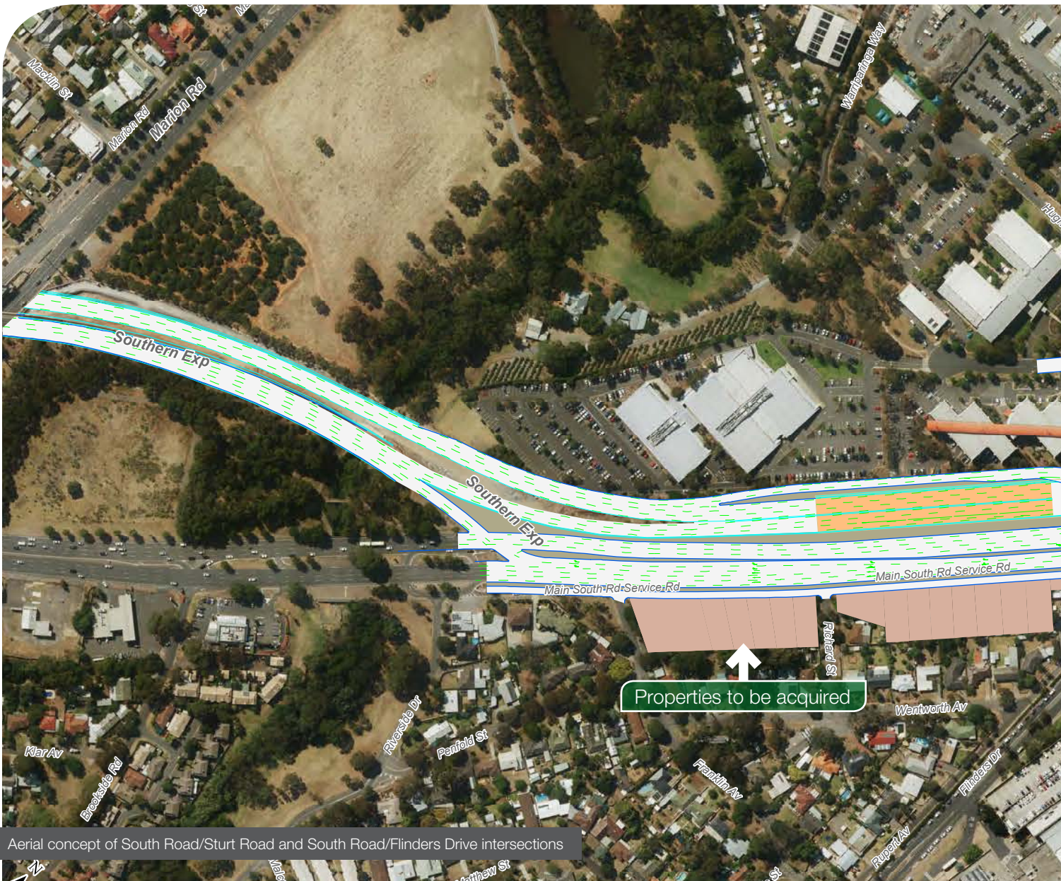
Aerial concept of South Road/Sturt Road and South Road/Flinders Drive intersections

During these periods vehicles are restricted to speeds lower than average for the city. Left as is, it will not be able to cope with the projected growth in traffic needing to use the roadway.