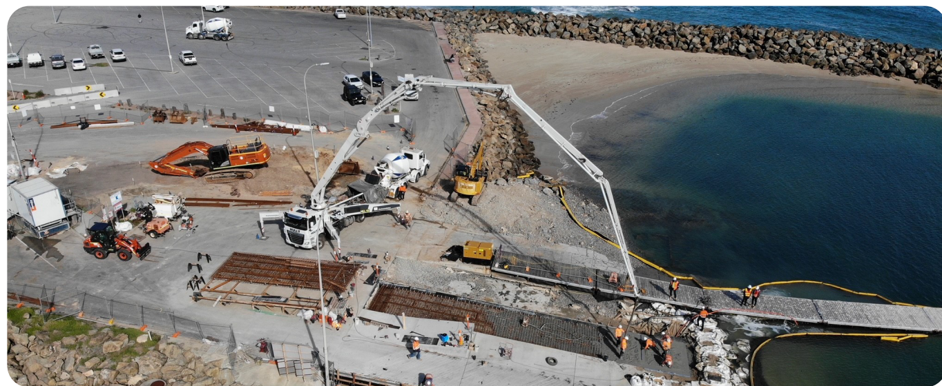
Works are continuing on the O’Sullivan Beach Boat Ramp Upgrade (July 2023)