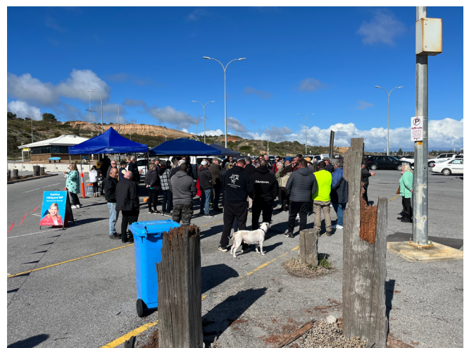
Approximately 90 community members and facility users attended the information session held on Saturday, 20 May 2023.