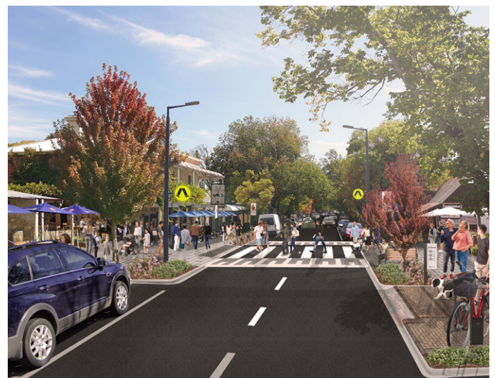
Artist Impression – New pedestrian crossing: Hahndorf Main Street.